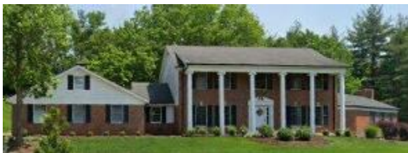
2004 Grecian Way

Vance is alleged to have shot 32-year-old Terron Vales, after the victim refused to give Vance and three others $400. The charging document then alleges that Vance fled the scene in the 2200 block of Yale in Maplewood and hid the murder weapon in a nearby garage.