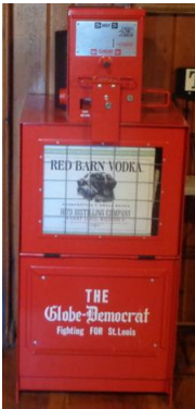
A Globe Democratic news box, back when the Globe and the Post were 25-cents.

There is one other problem with KMOV’s reporting is that the story claimed the crime happened on Wednesday November 18. I’m not sure what year that could have been. November 18, 2023 was a Saturday!