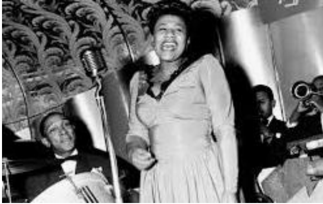
Nat King Cole