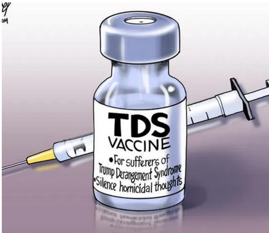
The Vaccine America Needs