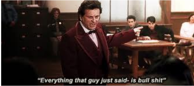
from My cousin Vinnie.