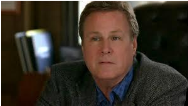
Actor John Heard, best known as the dad in Home Alone and the stalker in the real life of his former girlfriend, actress Melissa Leo, would be perfect to play Martin.