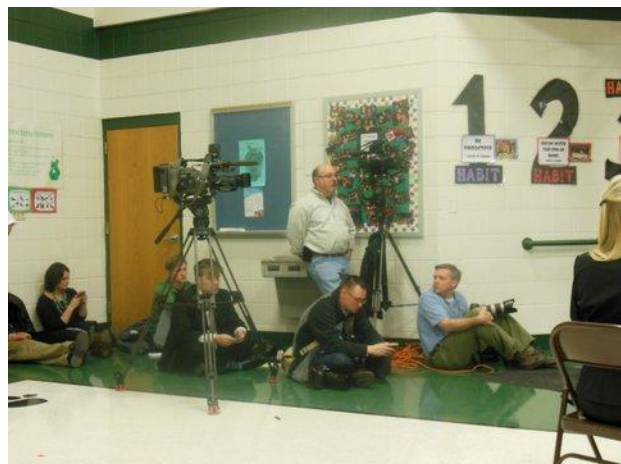
Here is the media after 90 minutes of pre-hearing motions.