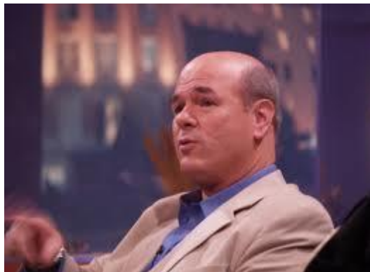
Comedian/actor Larry Miller would be perfect for the role.