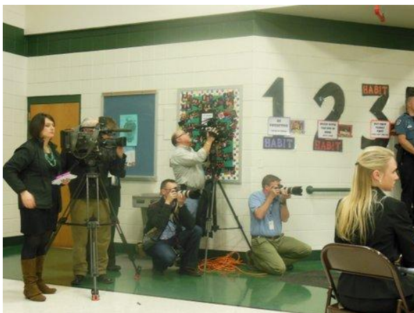
Here is the media at the start of the night.