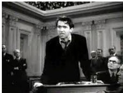
1939 Jimmy Stewart as Jefferson Smith