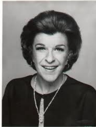
Nancy Walker, Rhoda's mom, Rosie the pitch Woman for Bounty paper towels and Mildred, McMillan and Wife's housekeeper