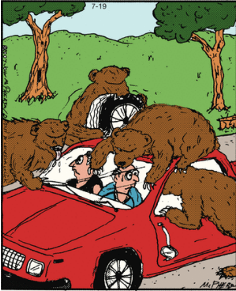
The Garcias discovered a huge drawback to driving a car that runs on vegetable oil.