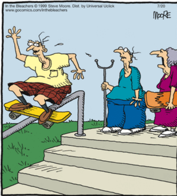
"It's called a 'skateboard,' you old coot! No one plays shuffleboard anymore!"