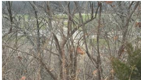
First plan possibilities