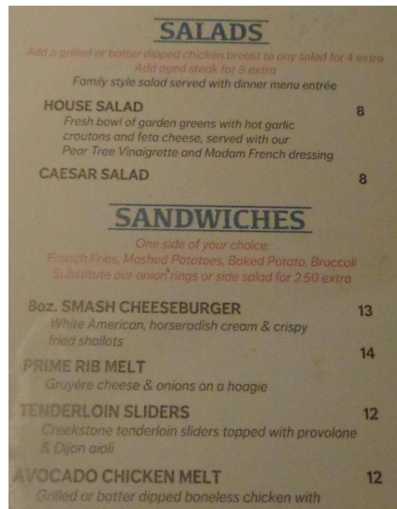
Portion of dinner menu versus portion of the Bar Menu

We decided to get the Prime Rib Melt and told the waitress we were going to split it. Our side was a salad, because I order a small serving of Syberg’s famous onion rings.